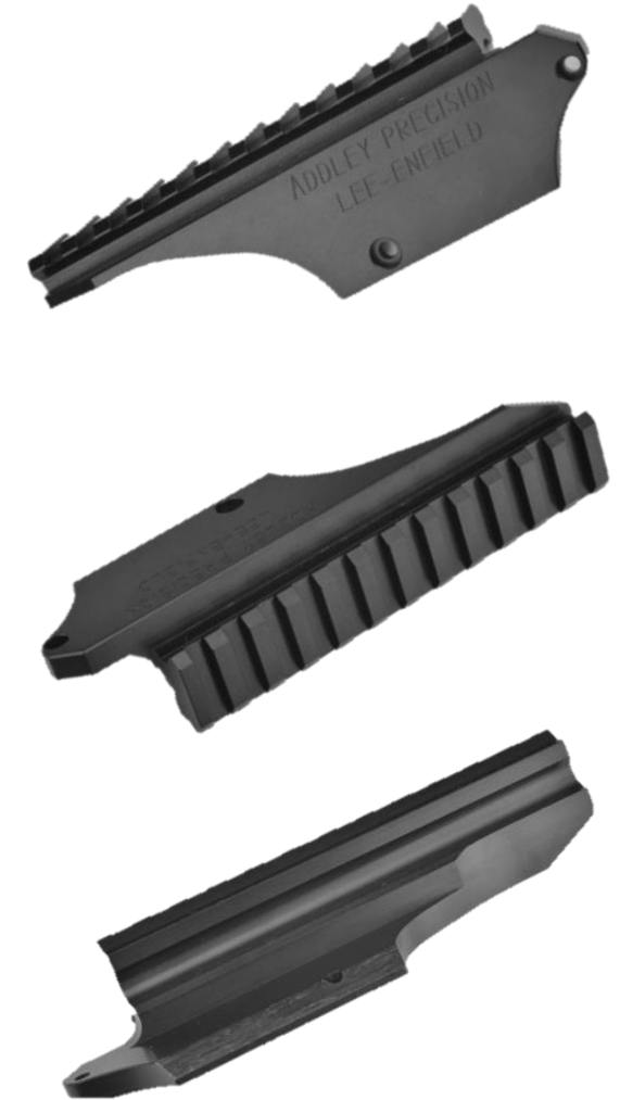
No. 5 .303 British Lee-Enfield Smith-less Scope Mount Installation Instructions

Check back regularly for new products and designs from Addley Precision.