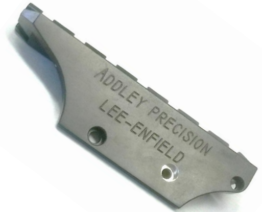
No. 4 Lee-Enfield Weaver Scope Mount (Parade Gun Style) Installation Instructions

Check back regularly for new products and designs from Addley Precision.